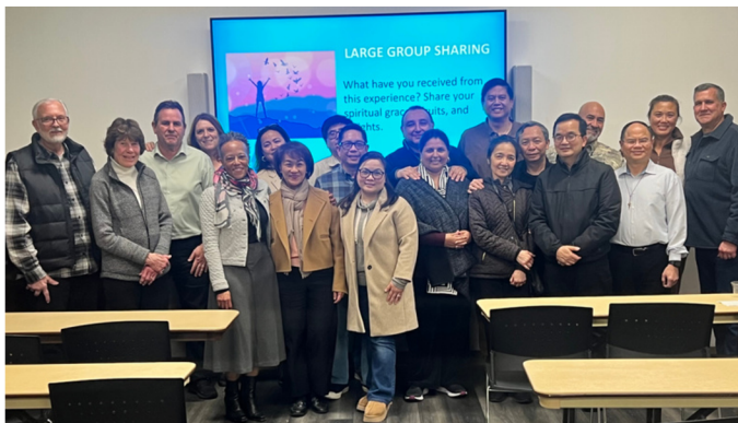
LIS team with Diaconate couples during First Spiritual Exercises Retreat